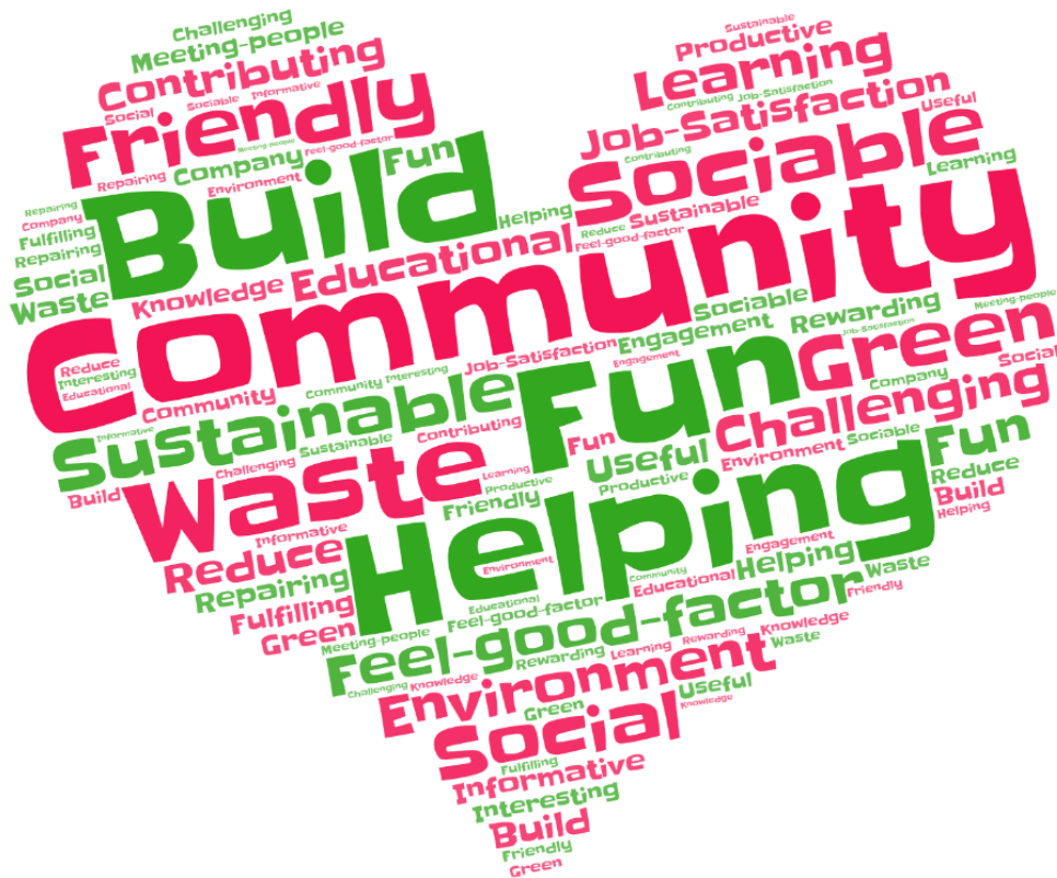
Word cloud generated from '3 little words' provided by Repair Cafe volunteers explaining what Repair Cafe means to them